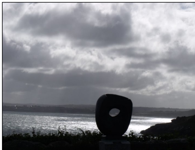
'Epidaurus' by Barbara Hepworth - on the sea front at St. Ives.