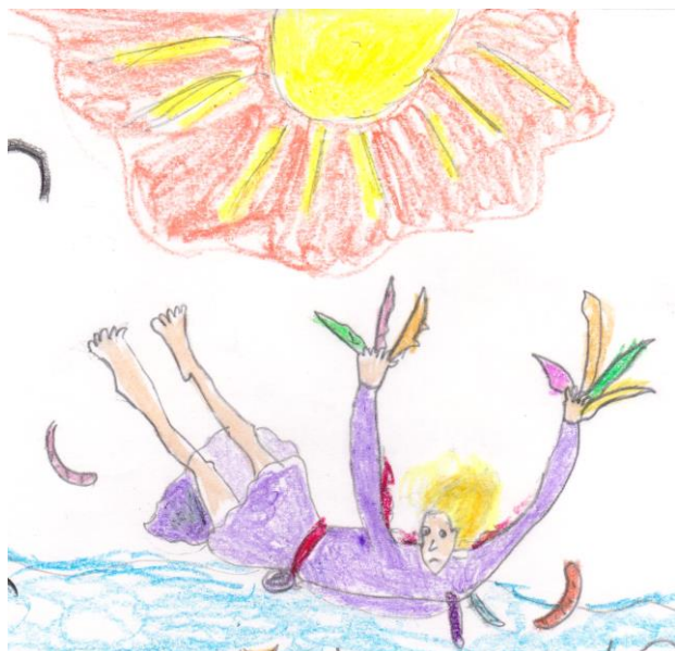
Thanks to Greta from our children's group for this picture of Icarus, who flew a bit too close to the sun.